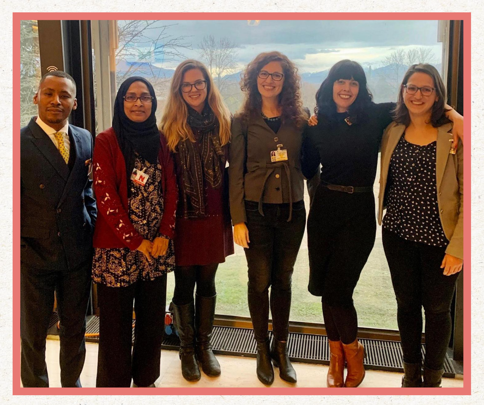
The CAL team at the UN Forum on Business and Human Rights, Geneva, November 2019

Corporate Accountability Lab develops innovative legal strategies to hold corporations accountable. We do this by researching and mapping the many actors involved in human rights and environmental abuses. We then use our unique human-centered legal design process to innovate and develop new legal strategies.